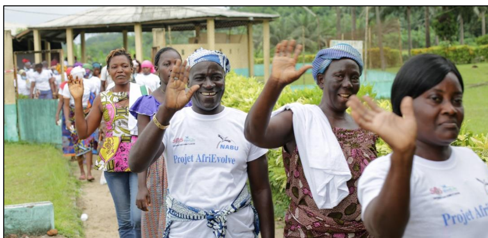
AfriEvolve Bee-keeping workshop in the Azagny national parc with women groups