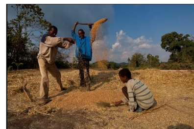
Ethiopian farmers next to the Boginda-Yeba forest